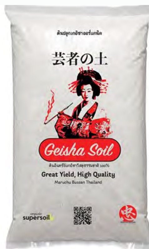
Geisha Premium Soil *Minerals are included 10KG