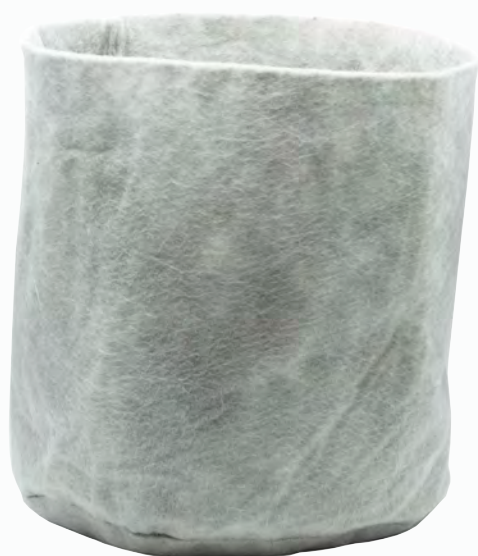
Geotextile Pot (white) 5 Gallons