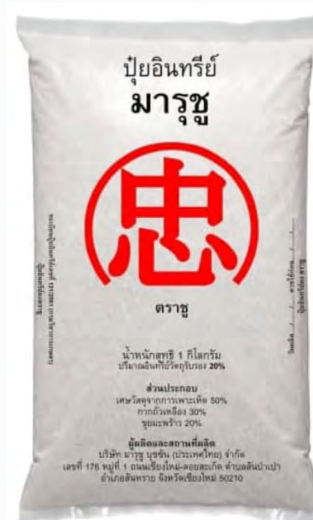
Takumi Fish Amino ( 1 litter) Chu Fertilizer 1kg NinjaKick Bloombooster 1kg